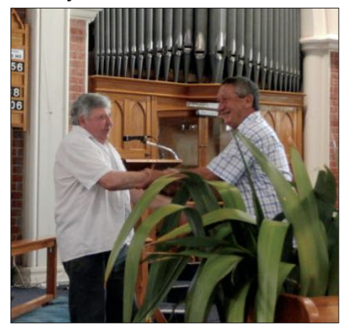
Negotiating better conditions

The Napier Cathedral AAW spent their first meeting in 2017, at the Napier ice-cream parlour, "Lick This", where the ice-cream, gelatos and sorbets are all made on site. We learned a lot about the way these are made, though the recipes remained a secret! After the sampling was finished we went onto our meeting, where we relived our December stroll around the city's sea-wall murals.