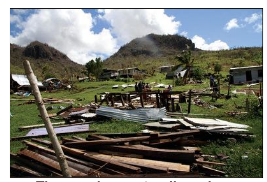
The people are standing where Simione Ravu's house once stood